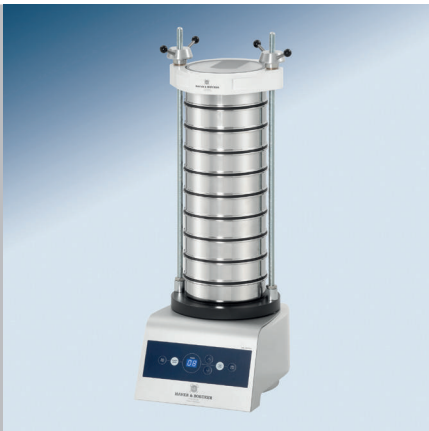
HAVER EML 200 PURE