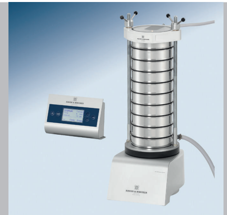
HAVER EML 200 PREMIUM REMOTE

Introducing the new EML 200 models - Premium, Pure and Remote. Their design represents a smooth evolution. Unobtrusive yet comprehensive changes have been made from top to bottom. The new machines are modern, of premium value and elegant. Their sleek and plain form pleasingly fits in the laboratory environment. All of the test sieve shakers are driven electromagnetically while generating a three-dimensional sieving motion with automatic amplitude. New - CSA 5.0 Basic license included when purchasing a EML 200 test sieve shaker.