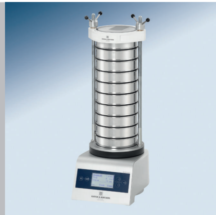
HAVER EML 200 PREMIUM